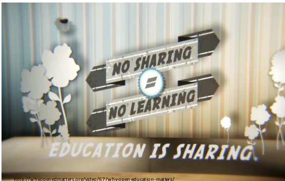
Why Open Matters Video