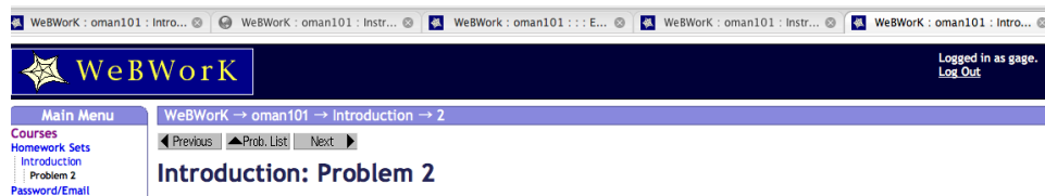
Figure 1: Logout

First click logout in the upper right corner and confirm to finish your session as a student.