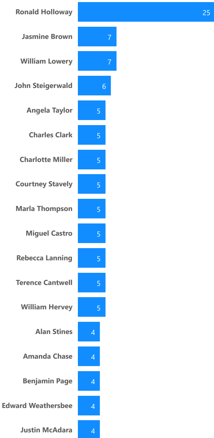
Top No-Cost Adopters (Course Sections)